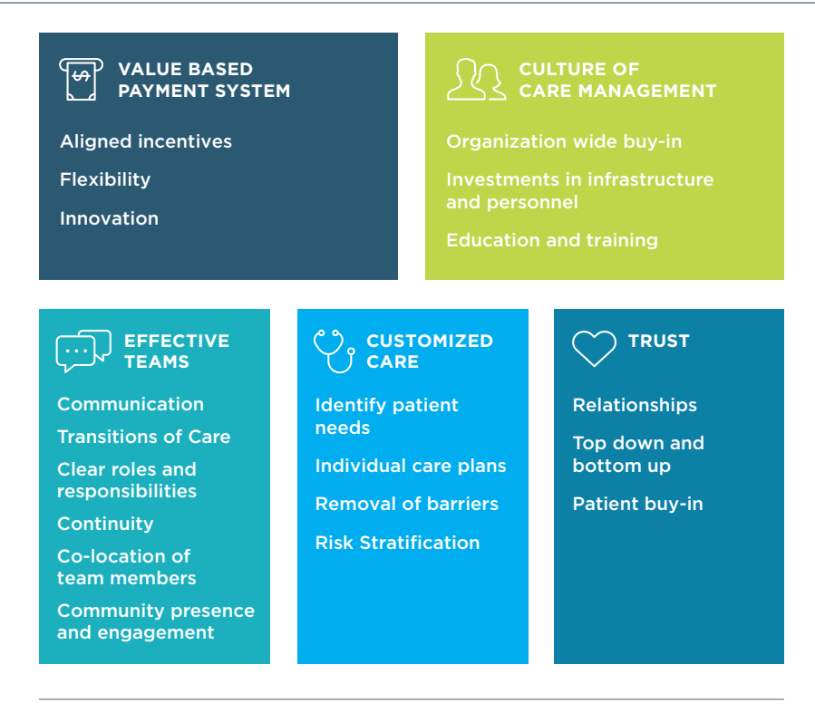
Bright Spots in Care Management in Medicare Advantage, June 2017